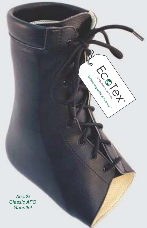
Acor® Classic AFO Gauntlet

**Independent lab testing shows EcoTex™ outperforms traditional leather in moisture absorption/desorption, tearing, abrasion, pilling, color change, and overall durability in wet and dry conditions.