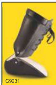
G9231 Dorsi-Assist Articulating