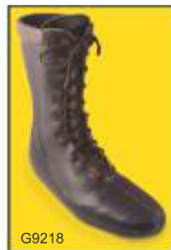
G9218 Chopart Toe Filler