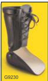
G9230 Flexure Joint Articulating