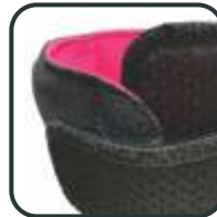
Mix & Match Color Combos